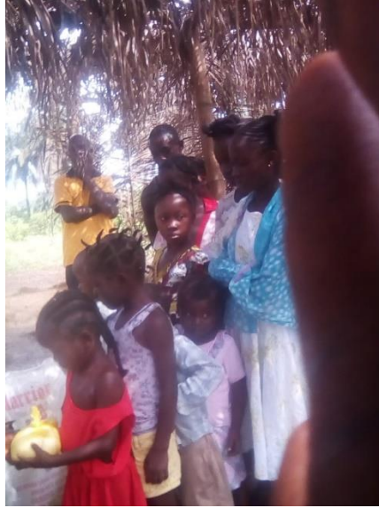
Lining up to receive rice (In the U.S., we think we have it bad because we have had to shelter in place and receive government cash.)