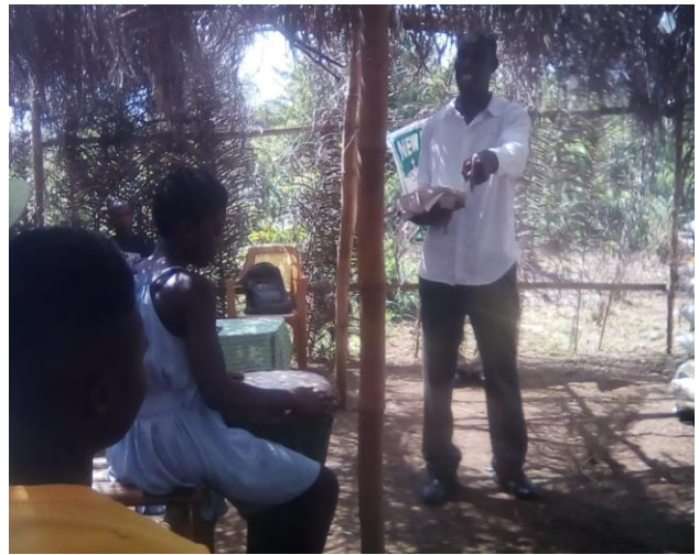
Now covered with thatch.