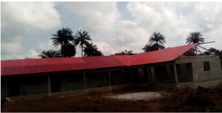
The building with the roof nearing completion:

This ministry focuses on the care of the orphans among the Liberian people living in the bush as a result of the economic havoc resulting from COVID 19 in Liberia. In Liberia, orphans must fend for themselves unless others step up and care for them. There is no welfare program for them. In addition, education is a critical component in this care. Because it is so critical in Liberia, this ministry launched a building construction project. As a result, an 8-room school building is nearing completion and classes began for the first time on January 4, 2021. This school is like the heart of the community for these people and especially for the orphans living among them. It is necessary for stability. Here are a few pictures that were taken in the beginning of 2021.