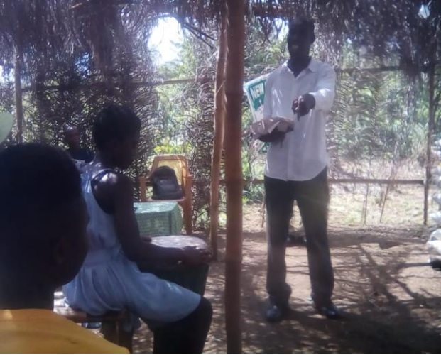
Now covered with thatch.