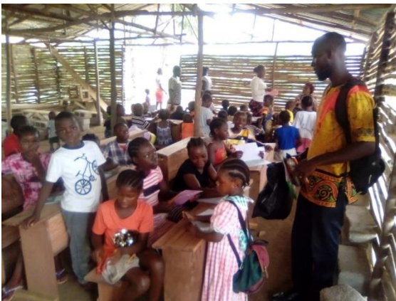
Children in class that began 1 4 2021