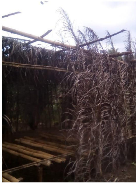
Not exactly a mega church building