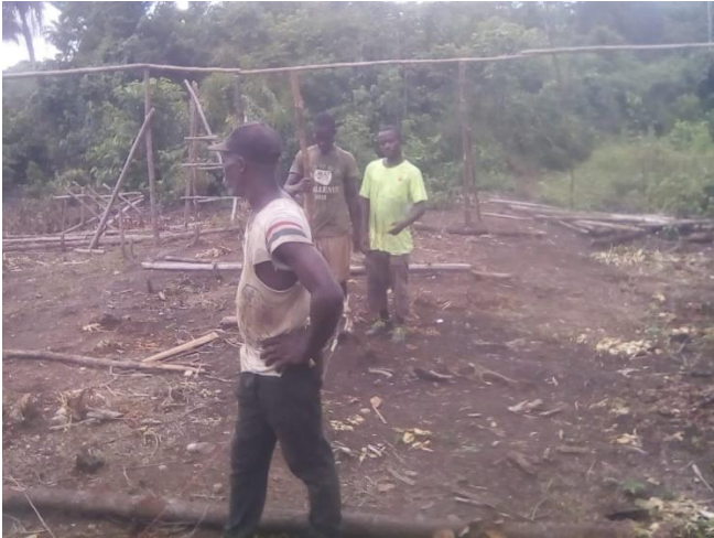
They are excited to make this attempt.